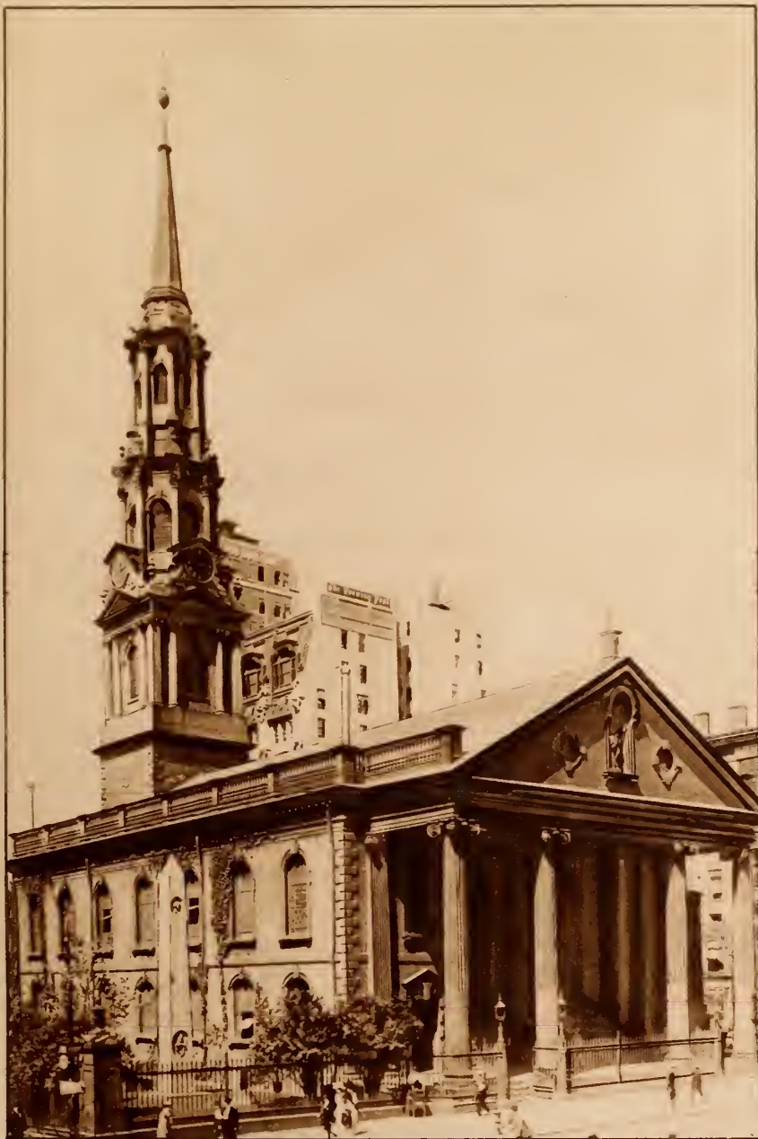
OLD ST. PAUL'S CHURCH, famous old structure.